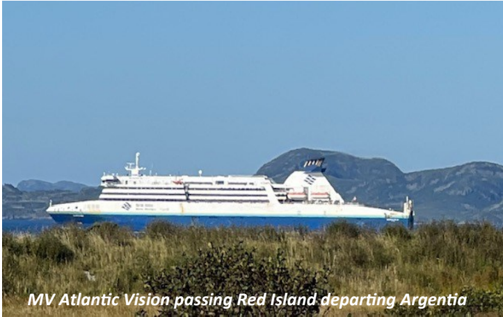
MV Atlantic Vision passing Red Island departing Argentia